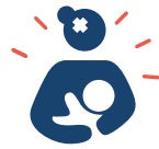
Mother Treated Violently